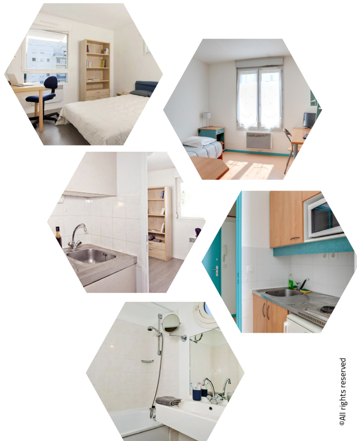
Private student residences pictures

Full board, with 3 meal by day included Monthly rent : €690