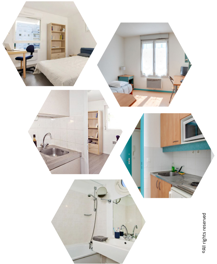
Private student residences pictures

Full board, with 3 meal by day included Monthly rent : €690